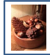
conkers and fir cones