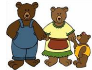
The Three Bears